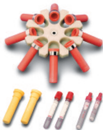
Swinging Bucket Rotor