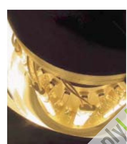
Interior heating of compressor housing