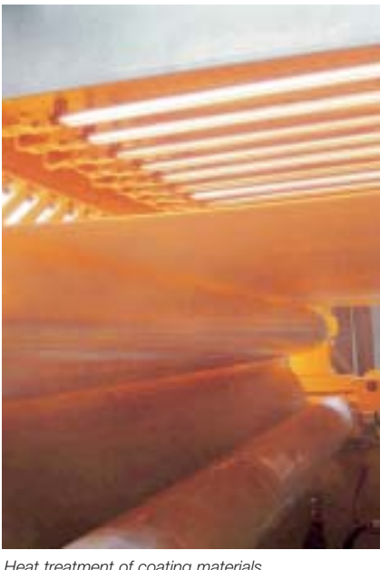
Heat treatment of coating materials