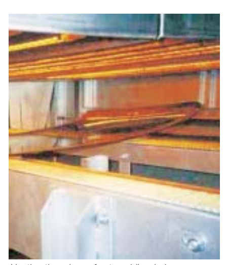
Heating the edges of automobile windows for improved PU foam retention