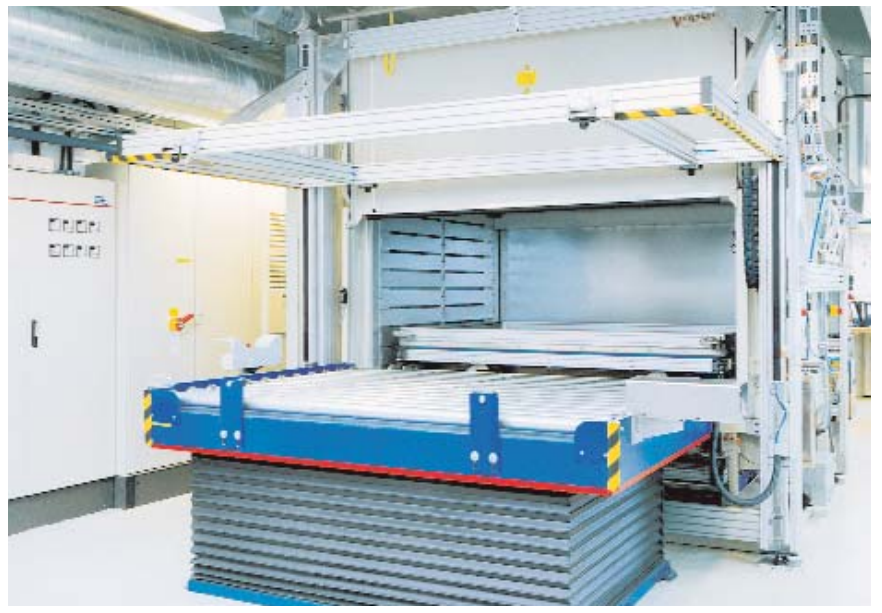
2-zone continuous oven for hardening carbon fibre composite material components