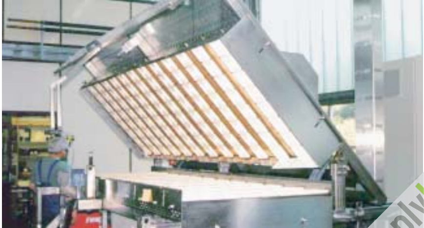
Heat treatment of glass fibre material prior to further processing