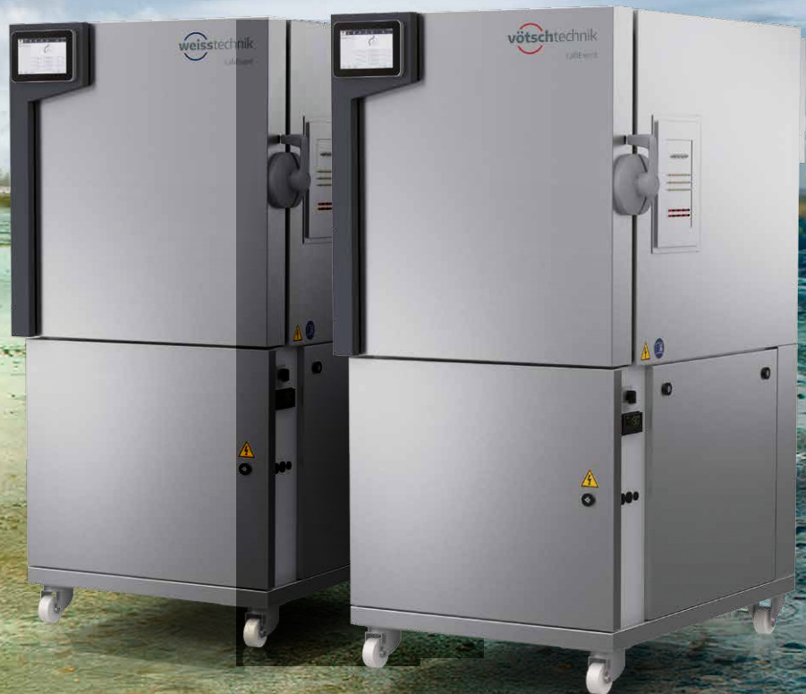
Illustration is similar, contains options